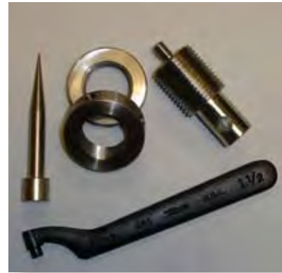
Shown: TLC Series load cells for the TCD Series testers are supplied with a 5/8" eye end, two locking rings, grip pin and spanner wrench.