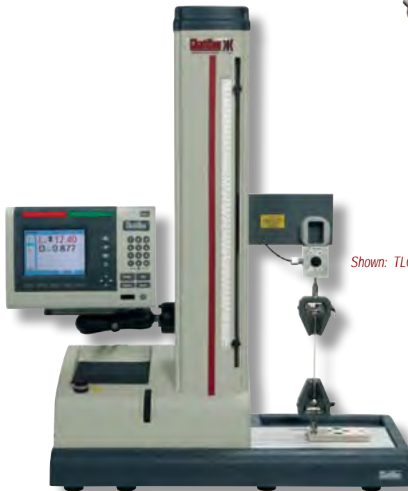
Shown: TLC Sensor attached to the Chatillon TCD225 force tester.