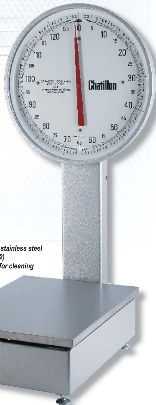
Shown with optional stainless steel platform cover (16012) Cover lifts off easily for cleaning